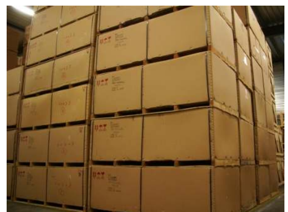
MTEE engine stock

Logistic handling for Mitsubishi Turbo Engines Europe B.V. (engine storage and handling)