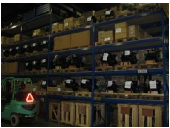
DET engine stock DET ( > 100 pcs)

To guarantee high level of service we need to have all common parts in stock, because of this, short delivery times are possible. We keep parts on stock of the current Mitsubishi diesel engine series like the; L, SL, SQ and SS and also of the well known SR series and SU parts are in stock. Besides Mitsubishi and Isuzu we have Japanese parts experience for more than 20 years. We supply Mitsubishi and Isuzu diesel engine parts.