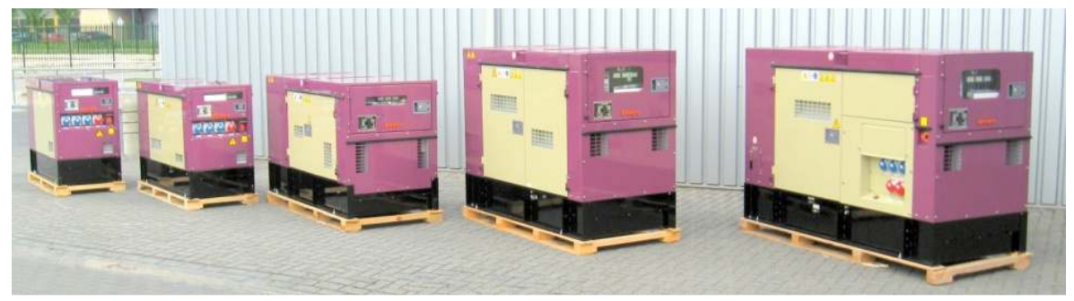
Models from 12kVA - 150 kVA (Isuzu engines)