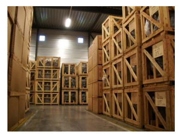
MTEE engine stock